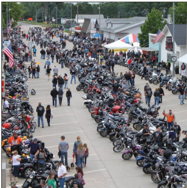
Cavalier Motorcycle Ride In

A visitor is defined as someone who has travelled 50+ miles or completes an overnight stay. A study done by the ND Department of Commerce – Tourism Division found that in 2013, Pembina County saw $38.42 million in visitor spending. This was a 9.8% increase from 2011. A majority of that spending was in food and shopping.