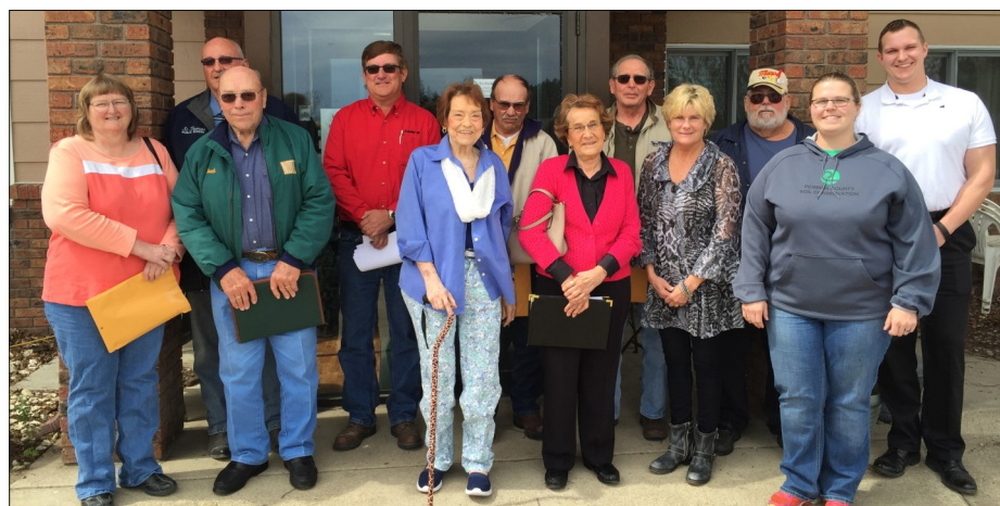
2015 PCJDA Board Members

Note: Investments include loans, grants, consultants, sponsorships and staff.