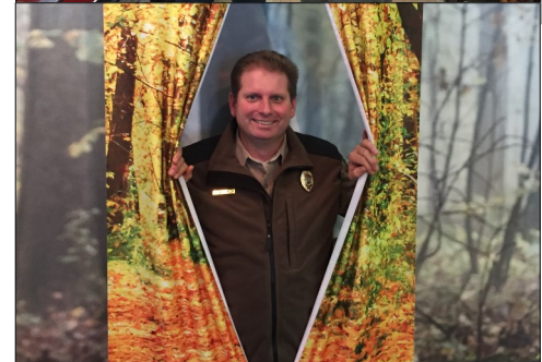
Pictured from top: Food First, Terry's True Value, Enduraplas, D & K Grocery, Icelandic State Park