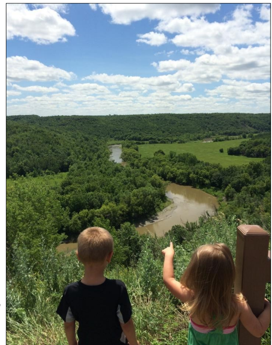
Pembina Gorge State Recreation Area

Through the efforts of many private and public partners, the region has amassed 700 miles of snowmobile trails, ski/board/tube area, summer theater, 25 miles of off-highway vehicle trails, several non-motorized trails, adventure races, renowned fossil digs, fishing tournaments, a music festival, motorcycle ride in, and more. All of these events and activities