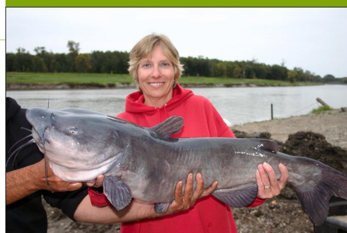
Rod & Reel Rally Catfishing Tourney, Drayton