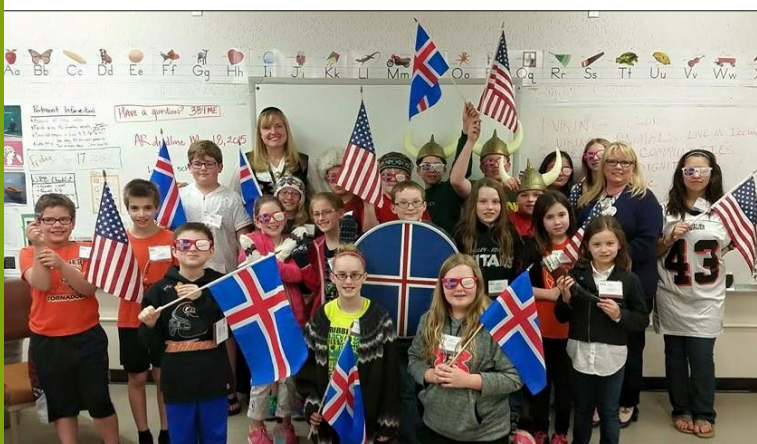
Marketplace for Kids - 600 Attendees in Cavalier, April 2015