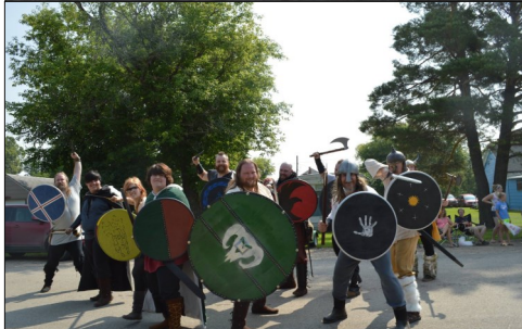
Pictured from top: OHV Trails, Pembina Gorge; Pumpkin Fest, Walhalla; Fossil Dig, Pembina Gorge; Pembina County Fair, Hamilton; Deuce of August Icelandic Festival, Mountain

drive thousands of visitors to the region year round.